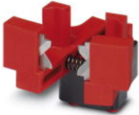
Replacement knife for the automatic stripping and crimping device CF 3000-2,5

Please be informed that the data shown in this PDF Document is generated from our Online Catalog. Please find the complete data in the user's documentation. Our General Terms of Use for Downloads are valid ( http://phoenixcontact.com/download )