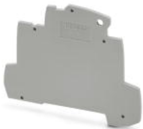
End cover for terminating a row of TERMITRAB complete TTC-6... terminal blocks

Please be informed that the data shown in this PDF Document is generated from our Online Catalog. Please find the complete data in the user's documentation. Our General Terms of Use for Downloads are valid ( http://phoenixcontact.com/download )