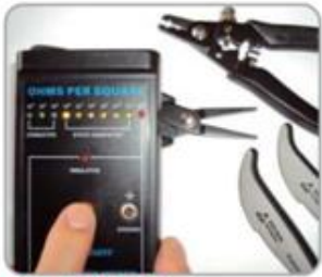
Conductive & Static Dissipative Machine