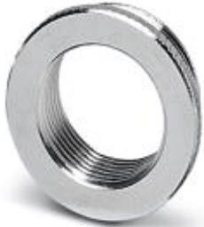
Reducing adapter, M40 on M32, incl. O-ring

Please be informed that the data shown in this PDF Document is generated from our Online Catalog. Please find the complete data in the user's documentation. Our General Terms of Use for Downloads are valid ( http://phoenixcontact.com/download )