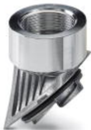
Adapter, aluminum, for EVO housing, M32 thread

Please be informed that the data shown in this PDF Document is generated from our Online Catalog. Please find the complete data in the user's documentation. Our General Terms of Use for Downloads are valid ( http://phoenixcontact.com/download )