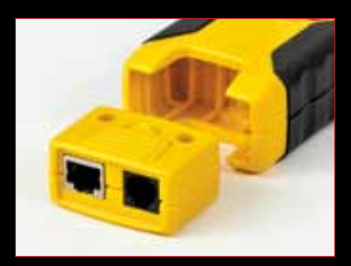
Self Storing Remote