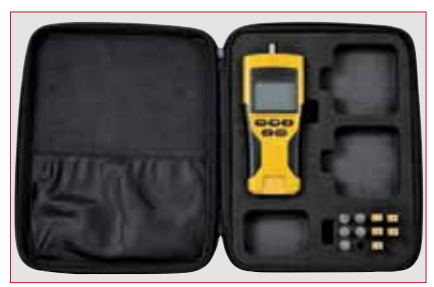
(Products not included)