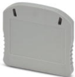
End cover, length: 19.9 mm, width: 2.2 mm, height: 17.7 mm, color: gray

Please be informed that the data shown in this PDF Document is generated from our Online Catalog. Please find the complete data in the user's documentation. Our General Terms of Use for Downloads are valid ( http://phoenixcontact.com/download )