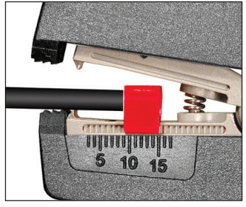
Wire Stop for precise strip length