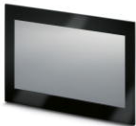
IP65-rated, 21.5-inch, flat panel LCD monitor with projected capacitive touch screen

Please be informed that the data shown in this PDF Document is generated from our Online Catalog. Please find the complete data in the user's documentation. Our General Terms of Use for Downloads are valid ( http://phoenixcontact.com/download )