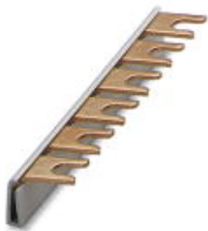
Wiring bridge for modules with connecting pitch 17.5 mm, 1-phase, 6-pos.

Please be informed that the data shown in this PDF Document is generated from our Online Catalog. Please find the complete data in the user's documentation. Our General Terms of Use for Downloads are valid ( http://phoenixcontact.com/download )