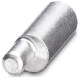
Cable lug for HEAVYCON-MODULAR; PE connection extension to 16 mm 2 , for crimping with crimp pliers

Please be informed that the data shown in this PDF Document is generated from our Online Catalog. Please find the complete data in the user's documentation. Our General Terms of Use for Downloads are valid ( http://phoenixcontact.com/download )