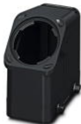
HEAVYCON EVO sleeve housing, plastic, with bayonet flange for EVO screw connection, B16, for double locking latch, height: 78 mm, without EVO screw connection

Please be informed that the data shown in this PDF Document is generated from our Online Catalog. Please find the complete data in the user's documentation. Our General Terms of Use for Downloads are valid ( http://phoenixcontact.com/download )