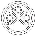
Pin assignment of M12 socket, 3-pos., S-coded, socket side view