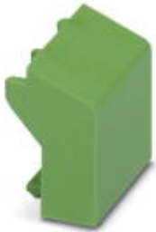
Filler plugs, for unoccupied terminal points

Please be informed that the data shown in this PDF Document is generated from our Online Catalog. Please find the complete data in the user's documentation. Our General Terms of Use for Downloads are valid ( http://phoenixcontact.com/download )