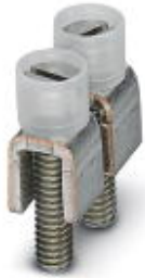
Fixed bridge, pitch: 10 mm, number of positions: 2, color: silver

Please be informed that the data shown in this PDF Document is generated from our Online Catalog. Please find the complete data in the user's documentation. Our General Terms of Use for Downloads are valid ( http://phoenixcontact.com/download )