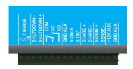
Figure 1. Detail of Auxiliary Connector (4)