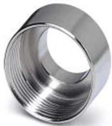
Step-up adapter, M32 to M40, including O-ring

Please be informed that the data shown in this PDF Document is generated from our Online Catalog. Please find the complete data in the user's documentation. Our General Terms of Use for Downloads are valid ( http://phoenixcontact.com/download )