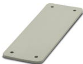
HEAVYCON cover plate, for panel cutouts of type B16/HV6, 3.5 mm thick, gray

Please be informed that the data shown in this PDF Document is generated from our Online Catalog. Please find the complete data in the user's documentation. Our General Terms of Use for Downloads are valid ( http://phoenixcontact.com/download )