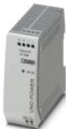
Primary-switched UNO POWER power supply for DIN rail mounting, input: 1-phase, output: 5 V DC/40 W

Please be informed that the data shown in this PDF Document is generated from our Online Catalog. Please find the complete data in the user's documentation. Our General Terms of Use for Downloads are valid ( http://phoenixcontact.com/download )