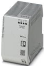
Primary-switched UNO POWER power supply for DIN rail mounting, input: 1-phase, output: 15 V DC/100 W

Please be informed that the data shown in this PDF Document is generated from our Online Catalog. Please find the complete data in the user's documentation. Our General Terms of Use for Downloads are valid ( http://phoenixcontact.com/download )