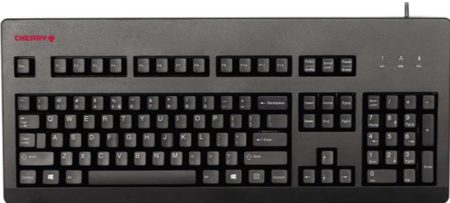
Models may vary from the image shown