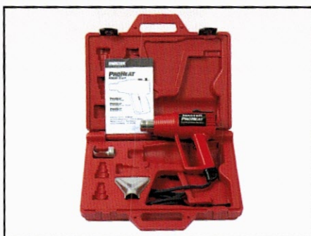
PH-2100K Professional Kit with 2 versatile attachments