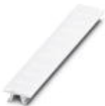
Zack marker strip, can be ordered: Strip, white, labeled according to customer specifications, Mounting type: Snap into tall marker groove, for terminal block width: 6.2 mm, Lettering field: 6.15 x 10.5 mm

Zack marker strip - ZB 6,LGS:FORTL.ZAHLEN - 1051016