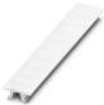
Zack marker strip, Strip, white, labeled, can be labeled with: CMS-P1-PLOTTER, Printed vertically: Consecutive numbers 1 - 10, 11 - 20, etc. up to 491 - 500, Mounting type: Snap into tall marker groove, for terminal block width: 6.2 mm, Lettering field: 6.15 x 10.5 mm

Zack marker strip - ZB 6,QR:FORTL.ZAHLEN - 1051029