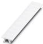
Zack marker strip, Strip, white, labeled, can be labeled with: CMS-P1-PLOTTER, Printed horizontally: Consecutive numbers 1 - 10, 11 - 20, etc. up to 491 - 500, Mounting type: Snap into tall marker groove, for terminal block width: 6.2 mm, Lettering field: 6.15 x 10.5 mm

Zack marker strip - ZB 6,LGS:FORTL.ZAHLEN - 1051016