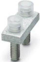
Fixed bridge, Pitch: 20 mm, Number of positions: 2, Color: silver

Please be informed that the data shown in this PDF Document is generated from our Online Catalog. Please find the complete data in the user's documentation. Our General Terms of Use for Downloads are valid ( http://phoenixcontact.com/download )