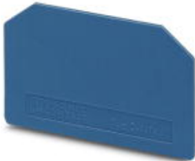
End cover, Length: 46.2 mm, Width: 1 mm, Height: 28.3 mm, Color: blue

Please be informed that the data shown in this PDF Document is generated from our Online Catalog. Please find the complete data in the user's documentation. Our General Terms of Use for Downloads are valid ( http://phoenixcontact.com/download )