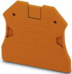
End cover, Length: 47 mm, Width: 2.2 mm, Height: 39.8 mm, Color: orange

Please be informed that the data shown in this PDF Document is generated from our Online Catalog. Please find the complete data in the user's documentation. Our General Terms of Use for Downloads are valid ( http://phoenixcontact.com/download )