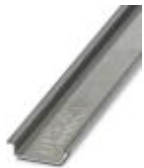
DIN rail, unperforated, Width: 35 mm, Height: 7.5 mm, Length: 2000 mm, Color: silver

DIN rail, unperforated - NS 35/ 7,5 AL UNPERF 2000MM - 0801704