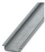
DIN rail, material: Galvanized, unperforated, height 7.5 mm, width 35 mm, length: 2 m

DIN rail, unperforated - NS 35/ 7,5 ZN UNPERF 2000MM - 1206434