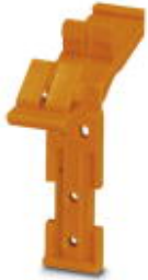
Latching, Number of positions: 2, Color: orange

Please be informed that the data shown in this PDF Document is generated from our Online Catalog. Please find the complete data in the user's documentation. Our General Terms of Use for Downloads are valid ( http://phoenixcontact.com/download )