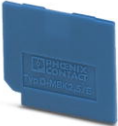
End cover, Length: 24.5 mm, Width: 1 mm, Height: 20.9 mm, Color: blue

Please be informed that the data shown in this PDF Document is generated from our Online Catalog. Please find the complete data in the user's documentation. Our General Terms of Use for Downloads are valid ( http://phoenixcontact.com/download )