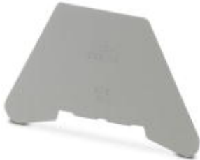
Partition plate, Color: gray

Please be informed that the data shown in this PDF Document is generated from our Online Catalog. Please find the complete data in the user's documentation. Our General Terms of Use for Downloads are valid ( http://phoenixcontact.com/download )