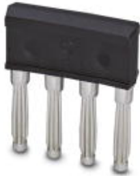
Short-circuit connector, Pitch: 10 mm, Number of positions: 4, Color: black

Please be informed that the data shown in this PDF Document is generated from our Online Catalog. Please find the complete data in the user's documentation. Our General Terms of Use for Downloads are valid ( http://phoenixcontact.com/download )