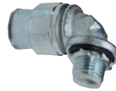
90° Fitting NPT Thread 3/8" through 2"