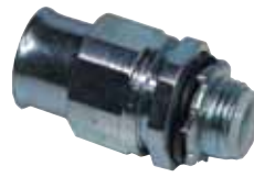
Straight Fitting NPT Thread 3/8" through 2"