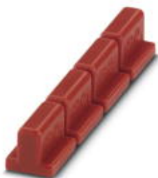
Coding profile, 4 coding profiles per strip, for insertion in coding keyways

Please be informed that the data shown in this PDF Document is generated from our Online Catalog. Please find the complete data in the user's documentation. Our General Terms of Use for Downloads are valid ( http://phoenixcontact.com/download )