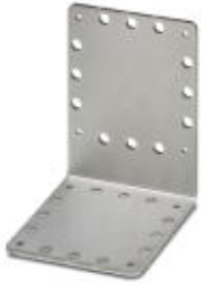
DUPLICON, mounting bracket, made of 3 mm high-grade steel plate, with predrilled holes

Please be informed that the data shown in this PDF Document is generated from our Online Catalog. Please find the complete data in the user's documentation. Our General Terms of Use for Downloads are valid ( http://phoenixcontact.com/download )