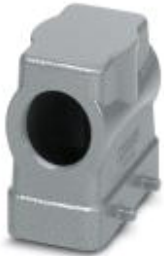
HEAVYCON B10 sleeve housing, for double locking latch, height: 72 mm, with 1 x M25 thread, lateral cable outlet

Please be informed that the data shown in this PDF Document is generated from our Online Catalog. Please find the complete data in the user's documentation. Our General Terms of Use for Downloads are valid ( http://phoenixcontact.com/download )