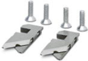
Spare knife for stripping machine

Please be informed that the data shown in this PDF Document is generated from our Online Catalog. Please find the complete data in the user's documentation. Our General Terms of Use for Downloads are valid ( http://phoenixcontact.com/download )