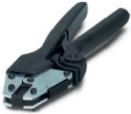
Crimping pliers, for CK 4,0... contacts, for 4.0 - 6.0 mm 2 conductor cross sections

Please be informed that the data shown in this PDF Document is generated from our Online Catalog. Please find the complete data in the user's documentation. Our General Terms of Use for Downloads are valid ( http://phoenixcontact.com/download )