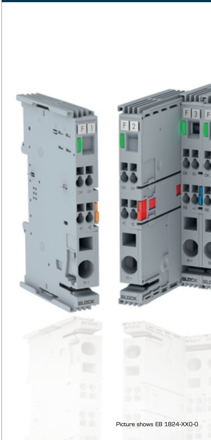
Picture shows EB 1824-XX0-0