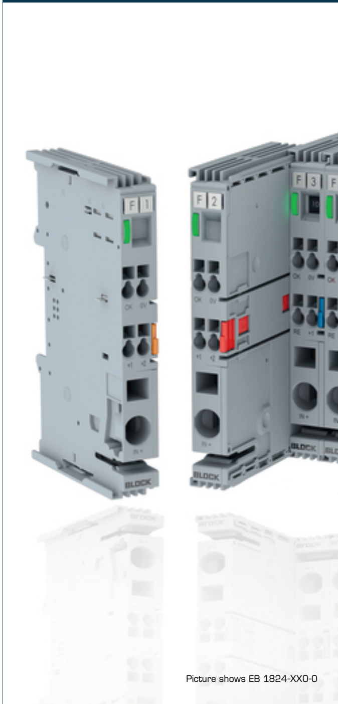
Picture shows EB 1824-XX0-0