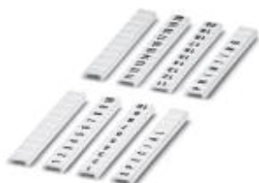
Zack marker strip flat, 10-section, horizontally labeled with the consecutive numbers: 41 ... 50, white, width: 3.5 mm

Please be informed that the data shown in this PDF Document is generated from our Online Catalog. Please find the complete data in the user's documentation. Our General Terms of Use for Downloads are valid ( http://phoenixcontact.com/download )