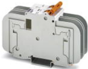
Thermomagnetic device circuit breaker, Width: 35.3 mm, Mounting type: DIN rail, Color: gray

Please be informed that the data shown in this PDF Document is generated from our Online Catalog. Please find the complete data in the user's documentation. Our General Terms of Use for Downloads are valid ( http://phoenixcontact.com/download )