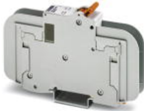
Thermomagnetic device circuit breaker, Width: 17.6 mm, Mounting type: DIN rail, Color: gray

Please be informed that the data shown in this PDF Document is generated from our Online Catalog. Please find the complete data in the user's documentation. Our General Terms of Use for Downloads are valid ( http://phoenixcontact.com/download )