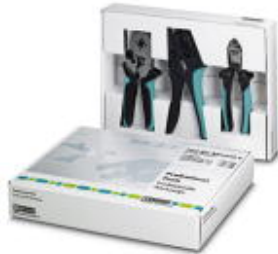
Tool set, equipped

Please be informed that the data shown in this PDF Document is generated from our Online Catalog. Please find the complete data in the user's documentation. Our General Terms of Use for Downloads are valid ( http://phoenixcontact.com/download )