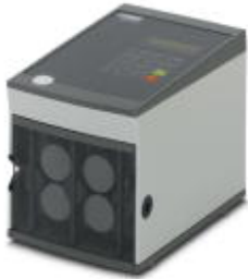
Automatic cutting device for cables, litz wires, and shrink sleeves, for 100 - 240 V mains voltage

Please be informed that the data shown in this PDF Document is generated from our Online Catalog. Please find the complete data in the user's documentation. Our General Terms of Use for Downloads are valid ( http://phoenixcontact.com/download )