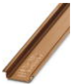
DIN rail, material: Copper, unperforated, height 7.5 mm, width 35 mm, length: 2 m

DIN rail, unperforated - NS 35/ 7,5 CU UNPERF 2000MM - 0801762