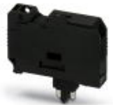
Fuse plug, Nominal current: 10 A, Length: 40 mm, Width: 8.2 mm, Height: 27 mm, Color: black