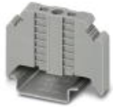
End clamp, width: 9.5 mm, color: gray