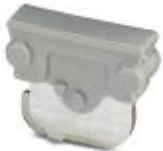
Feed-through connector, Length: 10.5 mm, Width: 4 mm, Color: gray

Feed-through connector - P-FIX - 3038956