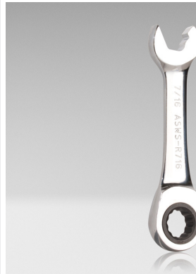
ASWS-R716 - Ratcheting Speed Wrench