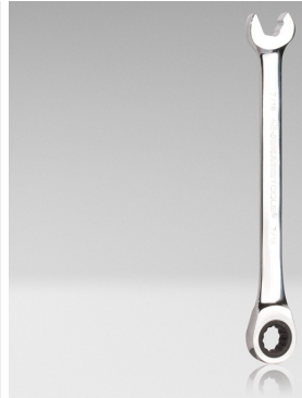
ASW-R716 - Speed Ratcheting Wrench