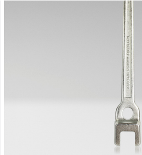
JIC-650 - Linesma