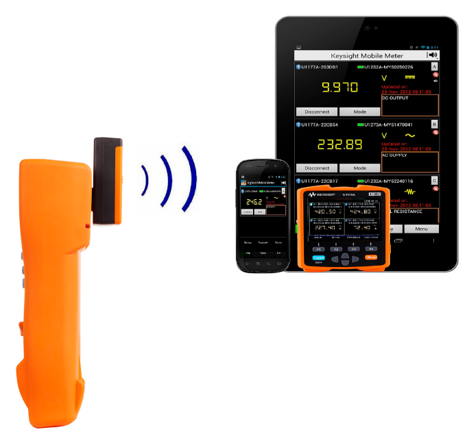
Figure 7. Pair up the U1280 series with Keysight Remote Link solution for wireless measurement option