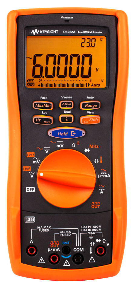
Figure 1. Large display and backlit keypad allow users to complete their jobs even in subdued lighting conditions.

Troubleshooting in most electrical environment is typically dangerous due to the high voltages involved. Now with the unique built in Vsense feature, you get a quick sense of AC voltage presence without the need to probe. When voltage presence is detected, it produces a unique combination of audible beeper alert and blinking LED light to alert users. This is especially useful to safeguard users from exposure to live wires, suspected AC voltage presence or simply an act of safety precaution before initiating a task. Work with a peace of mind knowing your safety comes first with Keysight's U1280 Series handheld DMM.