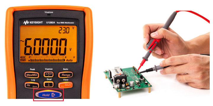
Figure 5. Hold & Export button—one press for three actions: Measure, save it into handheld DMM's memory and send the measurement out via infrared port. Optional U5404A remote switch probe emulates 'Hold & Export' button.

Keysight U1280 Series comes with programmability capability that allows avid programmer to create computer programs to control the handheld DMM. The programmability of Keysight U1280 Series allows users to automate Keysight U1280 Series or even integrate into bigger test systems.