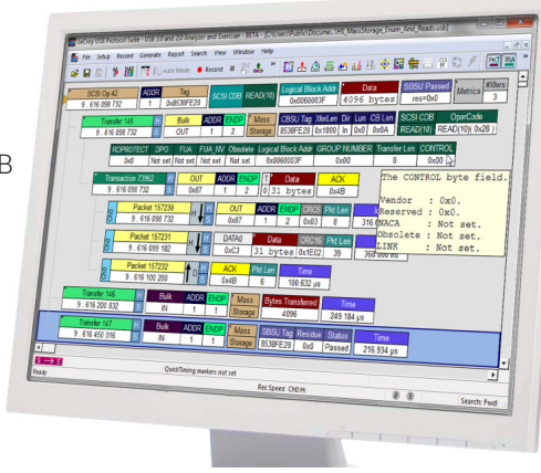
The CATC Trace display uses collapsible headers to group all packets that are part of a single transfer

The Mercury system provides many mechanisms to measure and report on USB traffic. The Bus Utilization display shows data, packet length and bus usage by device. Using the Traffic Summary window, users can evaluate statistical reports at a glance or navigate to individual fields. Real time statistics show throughput by endpoint.