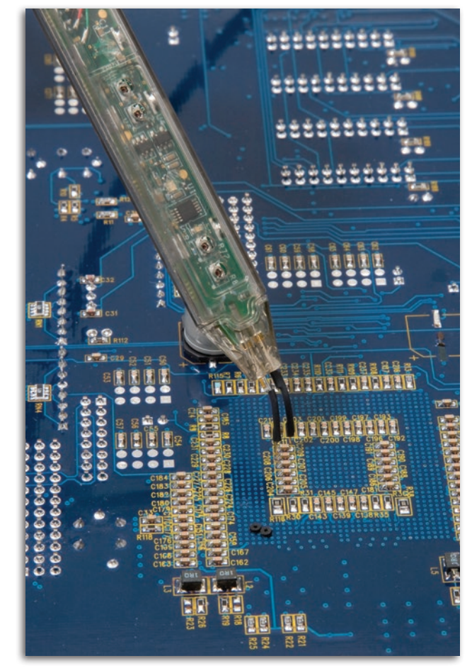
The short spring loaded ground leads can be used as either a ground accessory or an extension of the probe inputs.