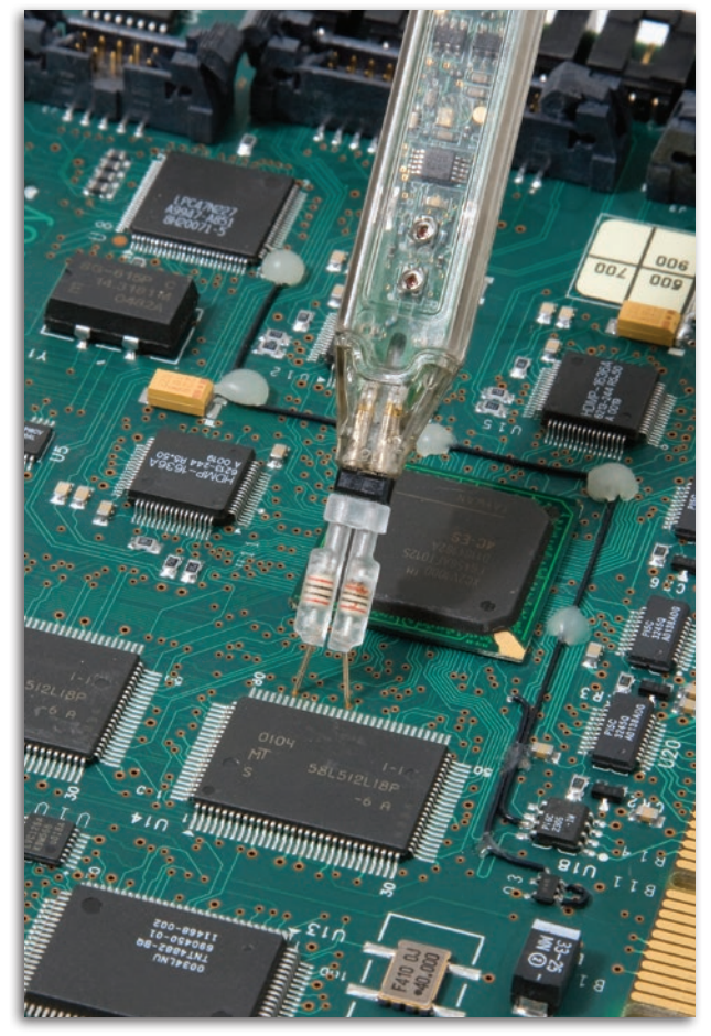
The Swivel Tip adapter can be adjusted to probe test points ranging from 0 to .300" apart with Z-Axis compliance.